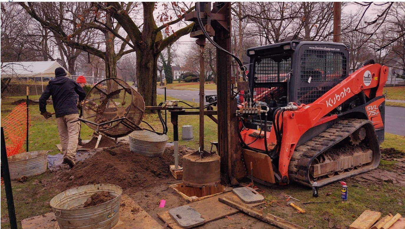
Deep testing through a wooden trench box as part of the Phase I Archaeology for the Pittston Bridge Replacement Project in West Pittston, Pennsylvania in January 2023.