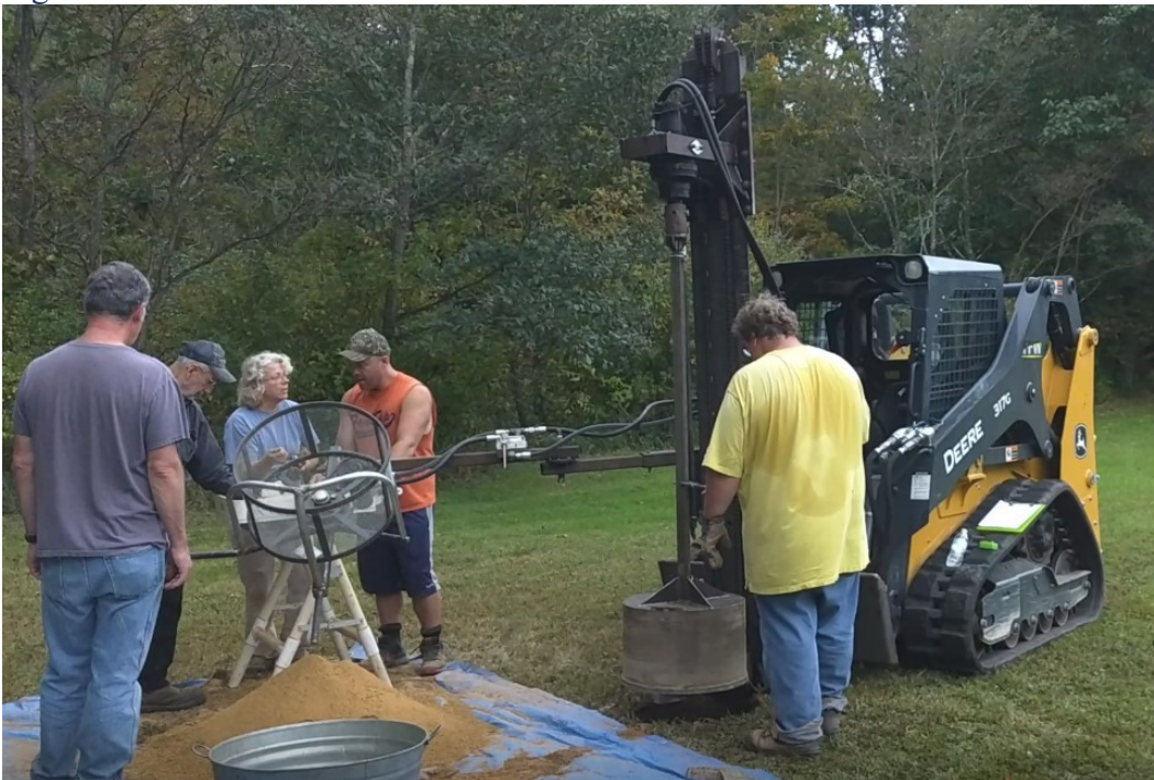
Test Excavations at the Slickerman Bottom Site (36SO304), a known Paleoindian site located along Beaver Dam Creek in Somerset County.