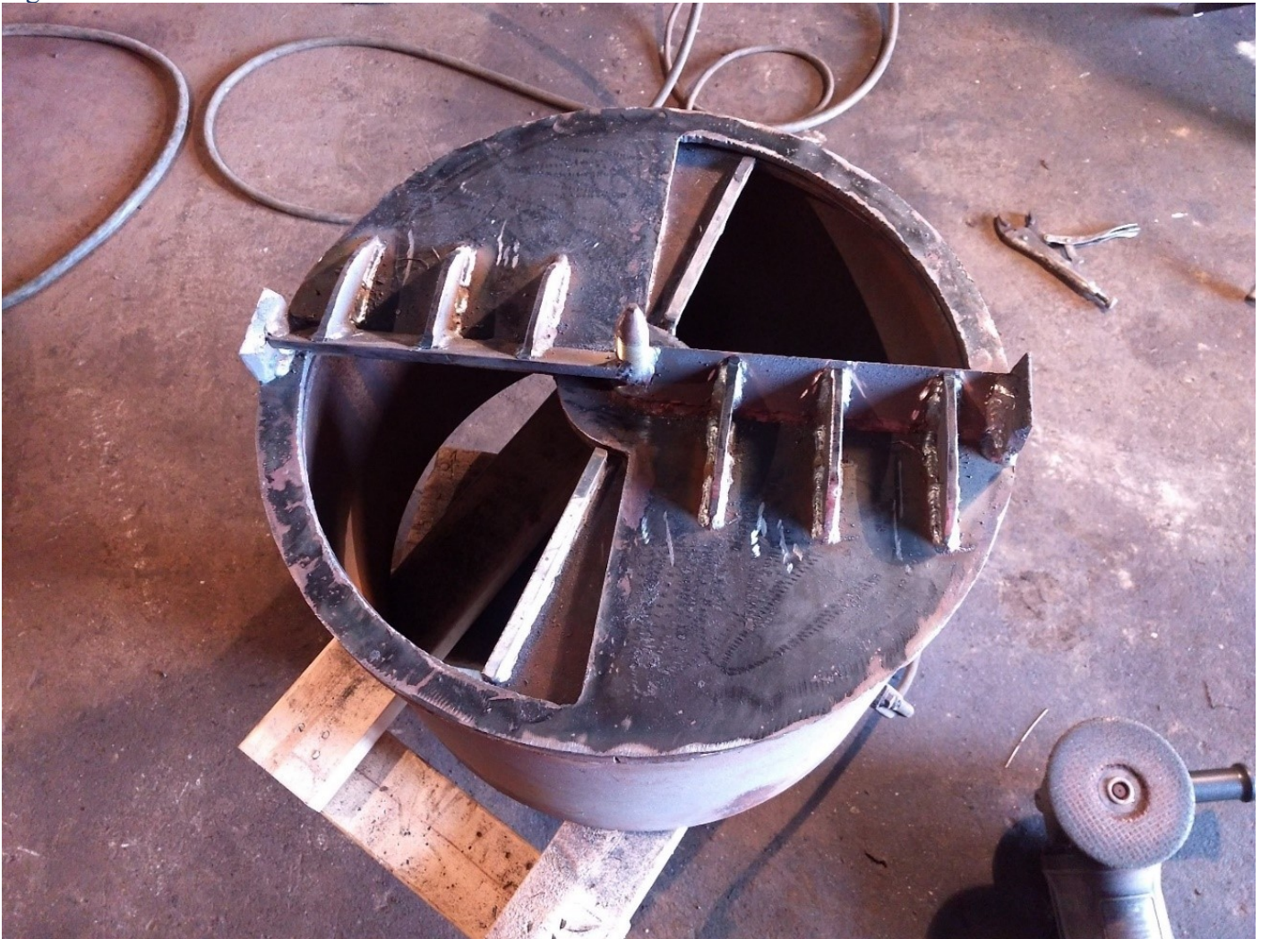
The bottom plate of the auger bucket rotates between its open and closed position.

The machine can excavate a standard-size shovel test pit (STP) to a depth of 7 meters. The machine has excellent vertical control and can remove soil in 5 or 10 cm levels. Each excavation level is cut to a flat surface. The self-closing auger bucket eliminates cross contamination between excavation levels. The PaleoDigger produces a hole with a consistent diameter, thus eliminating any vertical sampling bias (Figure 3).