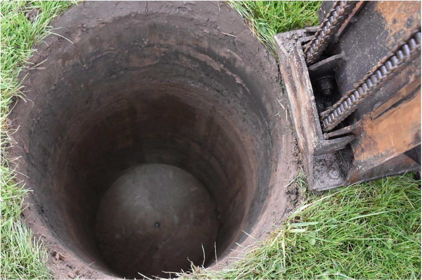
Example of a test pit excavated by the PaleoDigger machine.